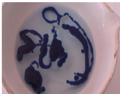
Fig. 1. Rayon fibers before decolorization.