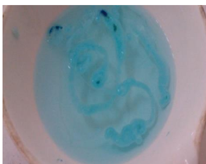
Fig. 2. Rayon fibers after decolorization.